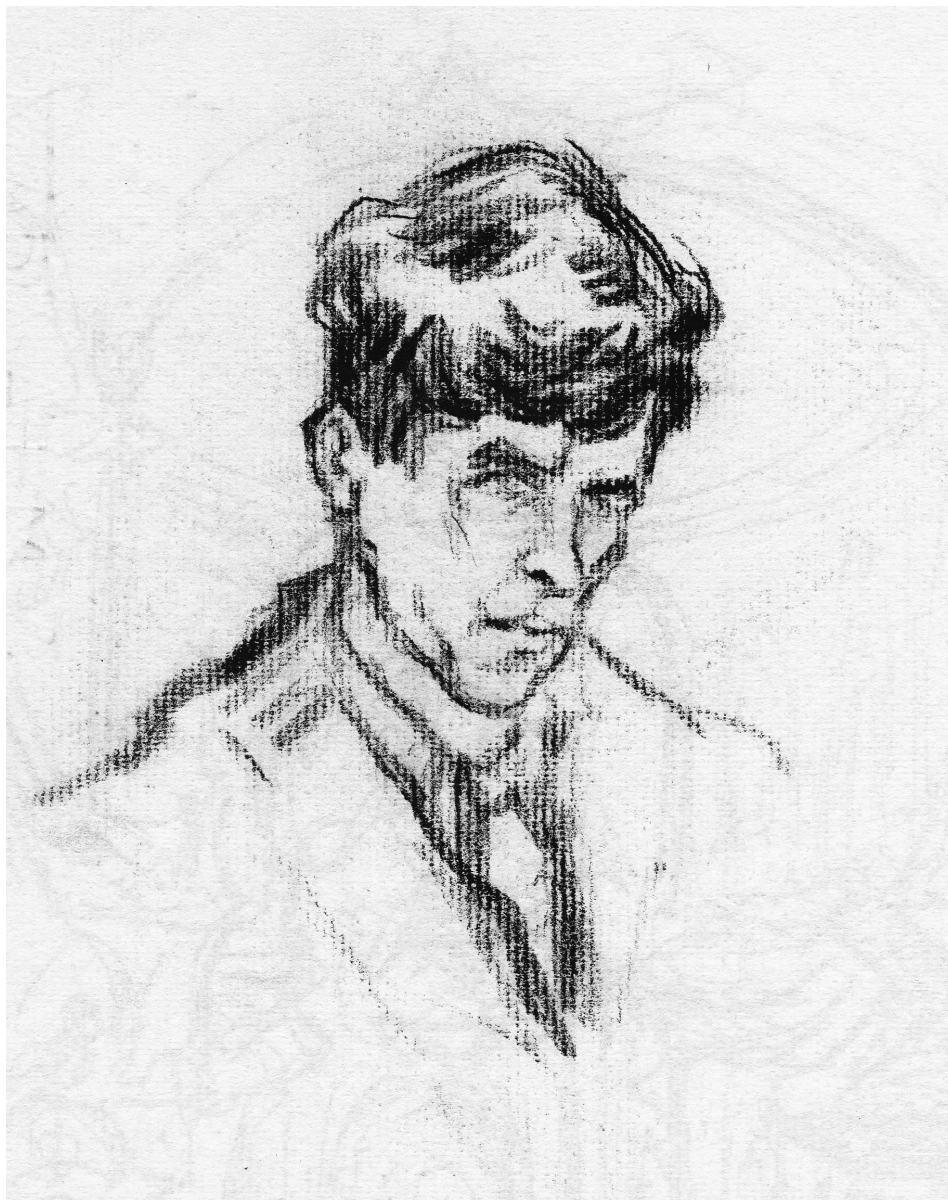
Charcoal portrait of Michael Tippett by Milein Cosman (born 1921); early 1950s

Having moulded the spirituals to his requirements, Tippett then realised that his own music would need to contain some of their rhythmic and harmonic features. He integrates elements of jazz such as chromaticism and syncopation, incorporates Blues intervals and other popular musical forms such as the tango rhythm which underlies the tenor solo 'I have no money for my bread' (Part I, No. 6). The double-chorus settings not only reflect Bach's Passions but also the call-and-response pattern of Gospel music. This is also referenced in the dialogue between soloists and choir where, for example in Part I, No. 7, the anxious questions of the mother, sung by the soprano, about the future of her family are answered by the choir in